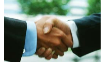
IFA has completed more than $16.5 billion in project financing since its inception January 1, 2004

The meeting agenda is posted by 5:00 pm the Friday prior to regularly scheduled board meetings. It can be viewed at www.il-fa.com/board .