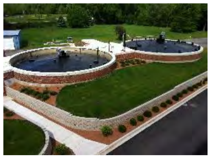
DeKalb Sanitary District New Anaerobic Digesters