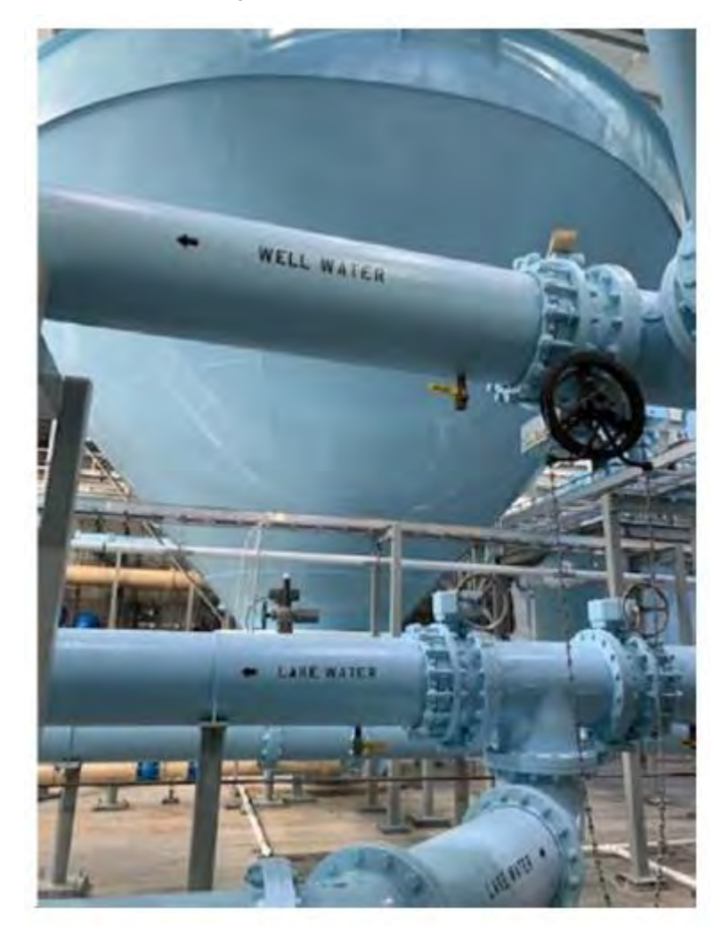
New Taylorville Water Treatment Plant