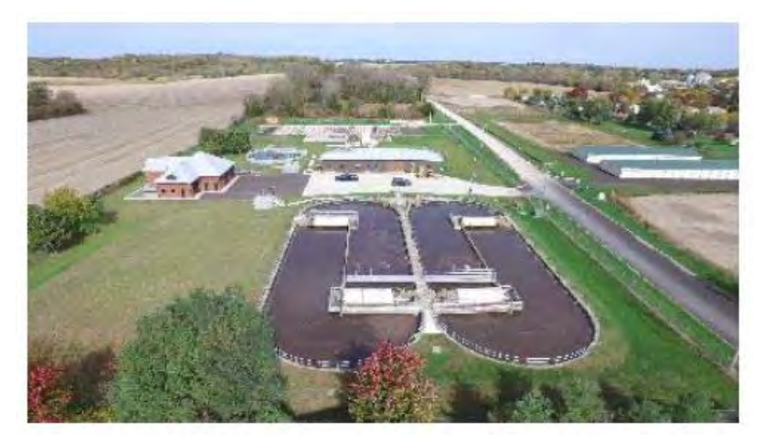
Village of Elburn Wastewater Treatment Plant Modernization